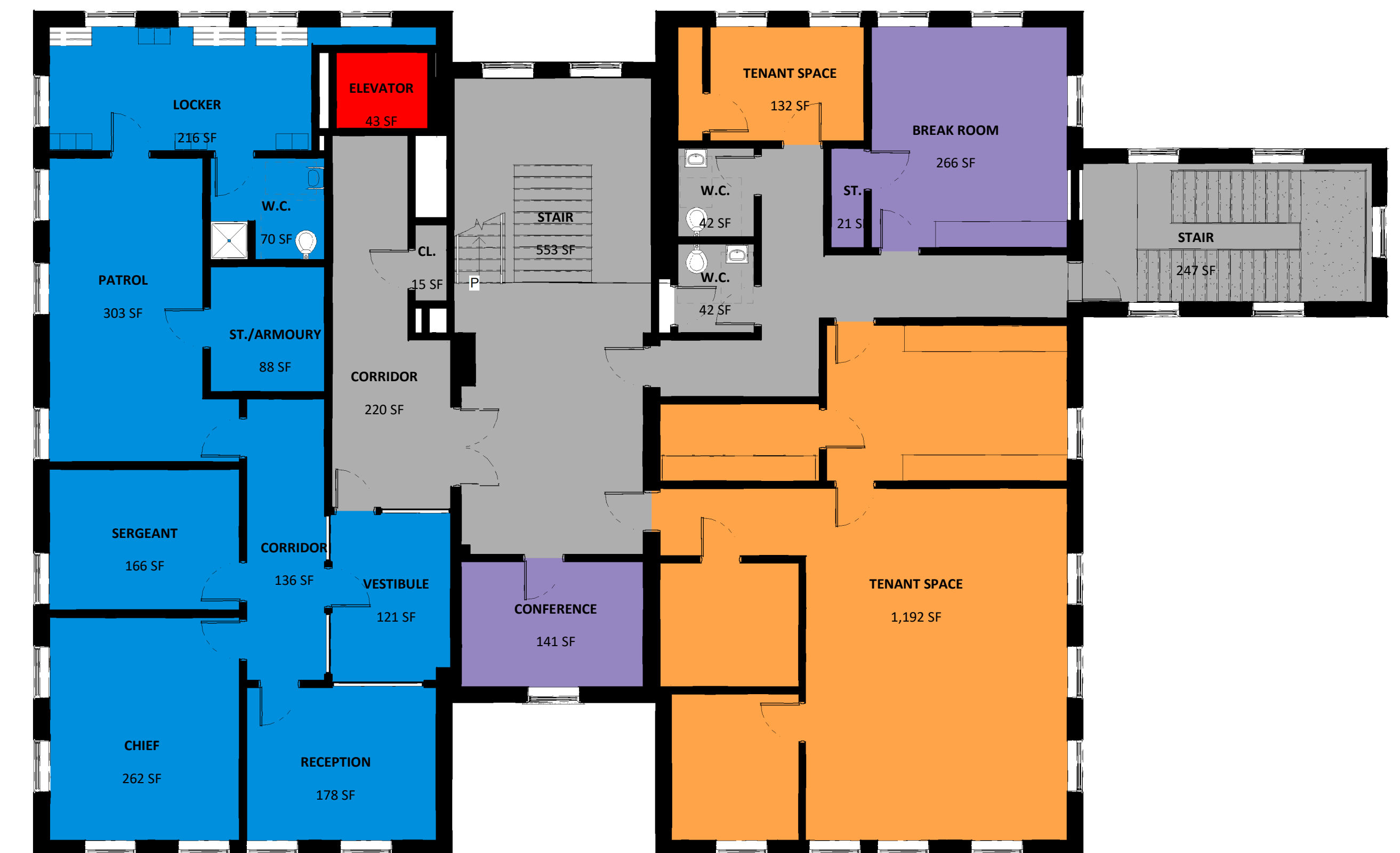
1 OPTION E1 - LEVEL 2 SCALE: 1/8" = 1'-0"