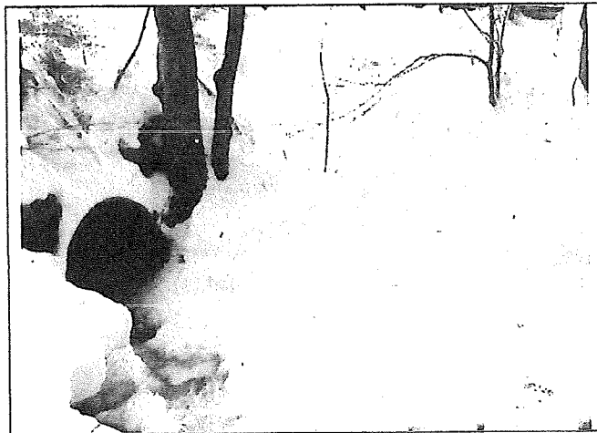
5' diameter CMP inlet and road embankment.

The existing structure is a 5' diameter corrugated metal pipe culvert, which is both galvanized and tar coated, providing approximately 20 ft 2 of waterway opening. The top half of the culvert appears to be in fair condition, given the age, however, the bottom portion of the culvert has lost all galvanized and tar coatings and shows signs of corrosion and deterioration. The inlet headwall of the culvert is stacked stone, which is in poor condition and is deteriorating. Due to the grade difference between the road and the stream, both the inlet and outlet slopes above the headwalls are very steep and show signs of erosion.