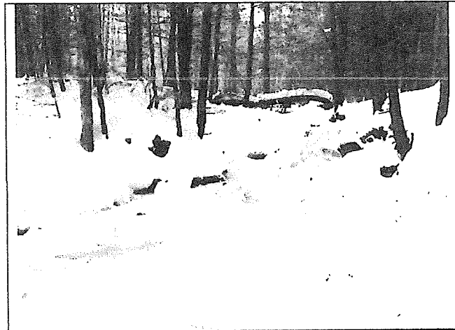
Upstream channel of un-named tributary.

This stream channel is steep and consists of large boulders, ledge outcroppings and plunge pools. Both inlet and outlet banks are steep and wooded. The bank full width varies and ranges from 8-12 feet, with several larger pool areas (depending on boulder/ledge locations) and several narrow channel locations. The depth of the stream varies and is shallow at some of the drops and has several pools that are several feet deep. The culvert inlet sits in a topographic