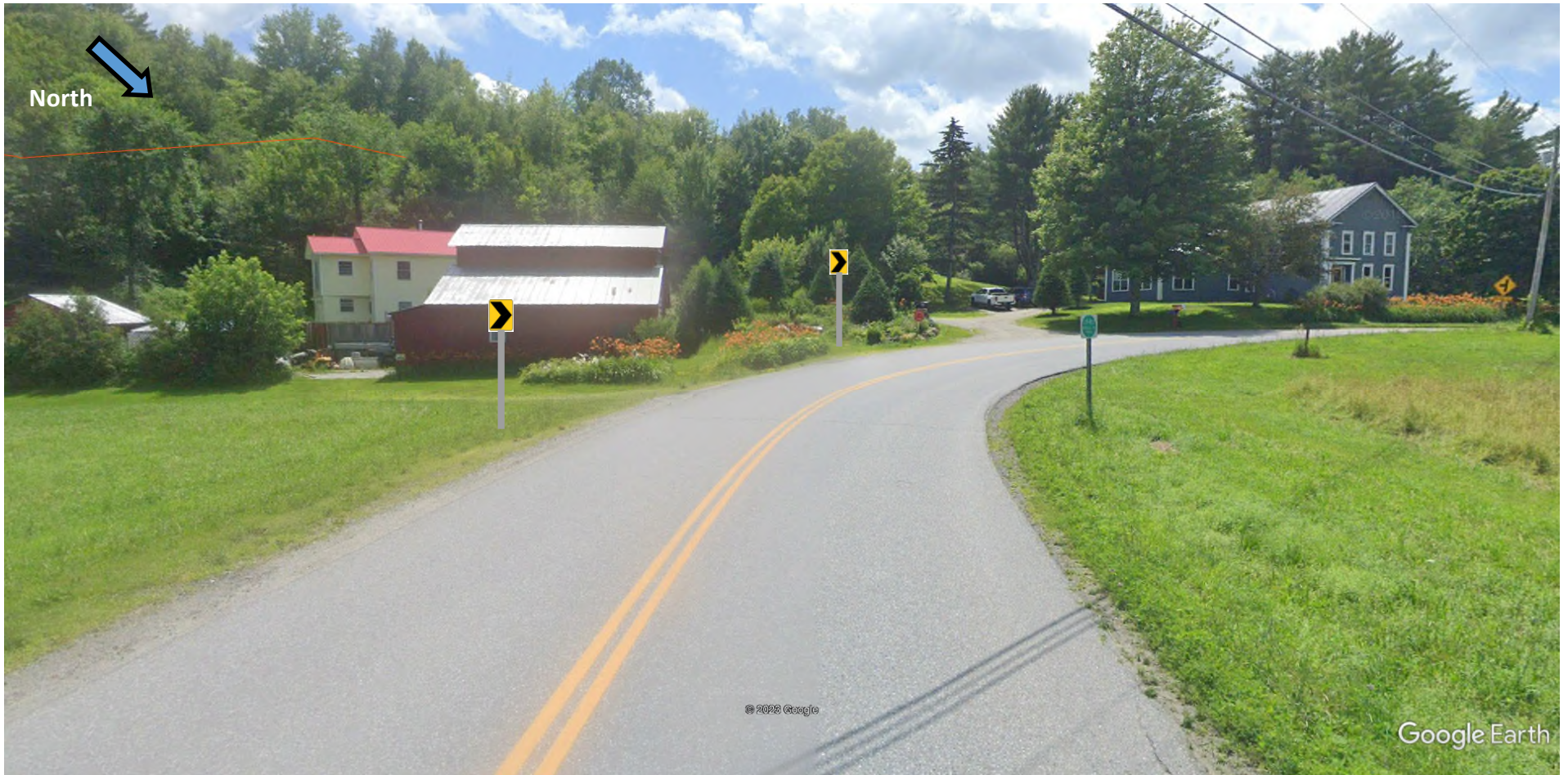
Cochran Road—East end