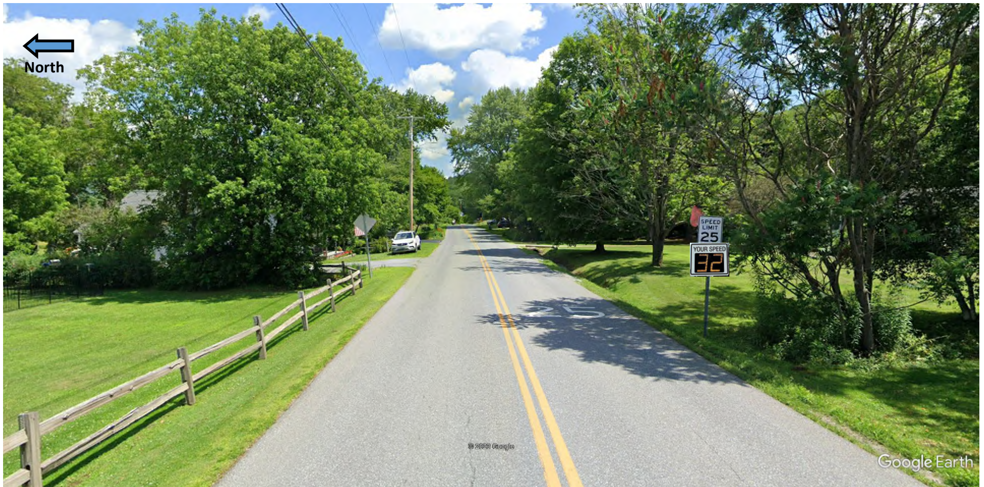
Cochran Road—West end