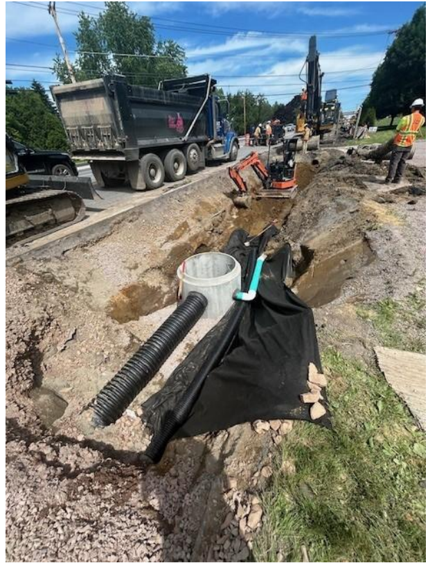
Roadway widening and drainage infrastructure installation take place along the east side of VT 2A between Mountain View Road and Sharon Drive in Williston, VT.