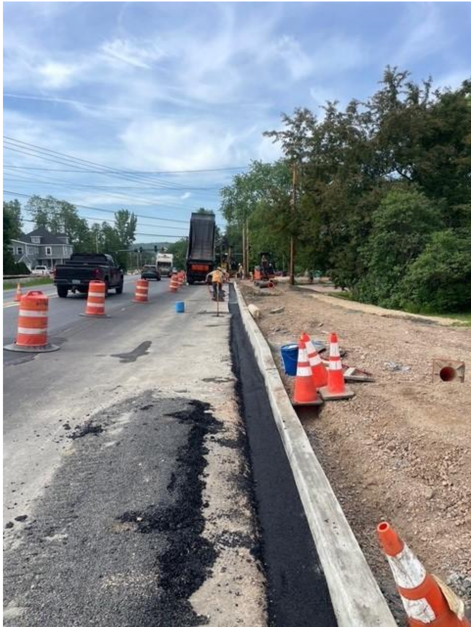
Crews pave in newly installed curb on the west side of VT 2A between Industrial Avenue and Hillside Drive in Williston VT.