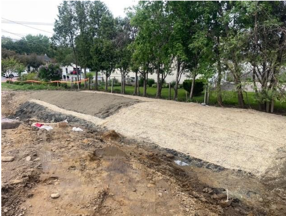
Crews construct the new bioretention pond at the northwest corner of Industrial Avenue and VT 2A in Williston, VT, including conducting excavation and drainage installation. Final landscaping activities remain.