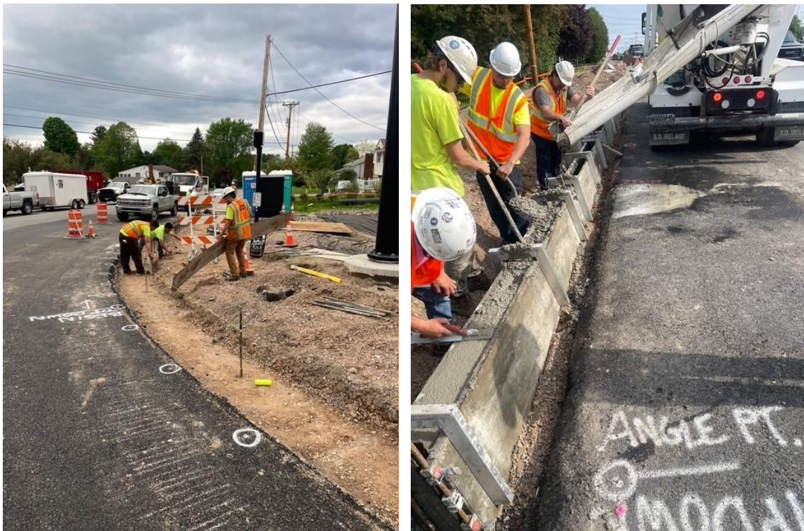
Crews install forms and pour new concrete curb along the west side of VT 2A between Industrial Ave and Hillside Drive in Williston, VT.

CONSTRUCTION ACTIVITIES: Following installation of new curb along the west side of VT 2A between Industrial Avenue and Hillside Drive, crews will complete backing and patch paving along the curb. They will also begin constructing the shared-use path along this segment of VT 2A. Work on the new bioretention pond at the northwest corner of the VT 2A and Industrial Avenue intersection will continue next week.