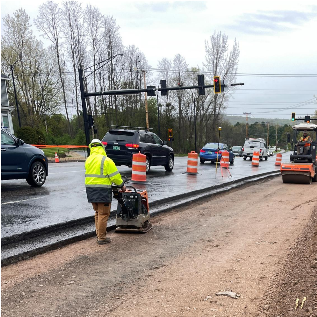
Crews fine-grade the west side of VT 2A between Industrial Avenue and Hillside Drive in Williston, VT.