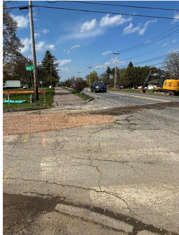
New sewer is installed and backfilled along Hillside Drive at the VT 2A intersection in Williston, VT.