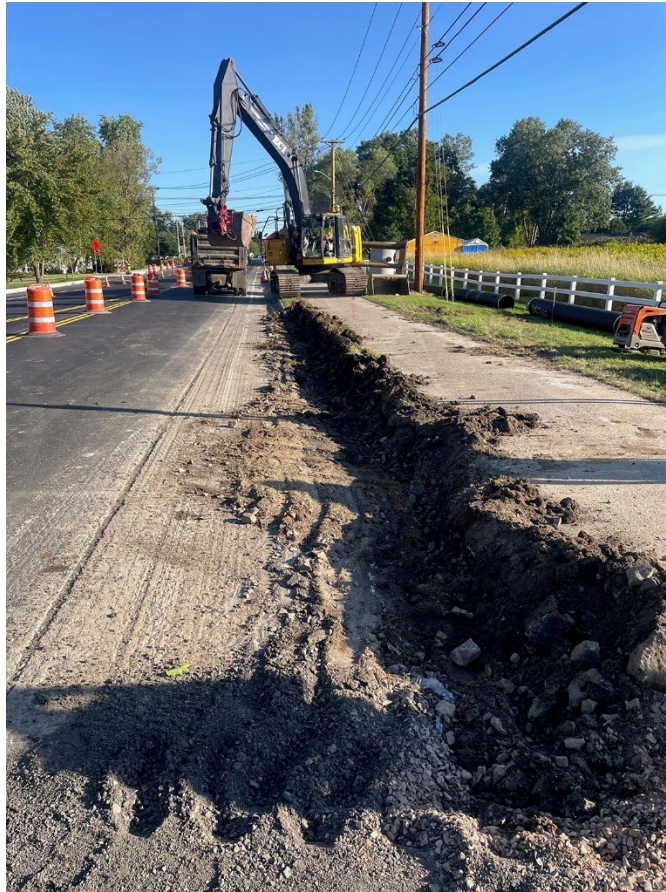
Crews excavate along the east side of VT 2A between Meadowrun Road and Mountain View Road.