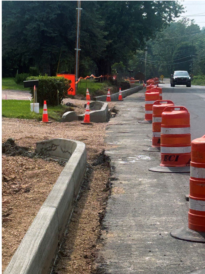
Crews install new curb along Industrial Avenue and VT 2A in Williston, VT.