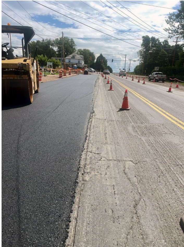
Crews continue to pave along Industrial Avenue this week in Williston, VT.