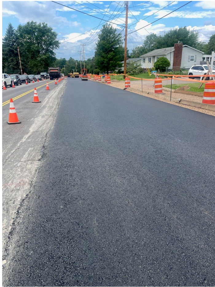
Crews begin paving the Industrial Ave westbound lane in Williston, VT.