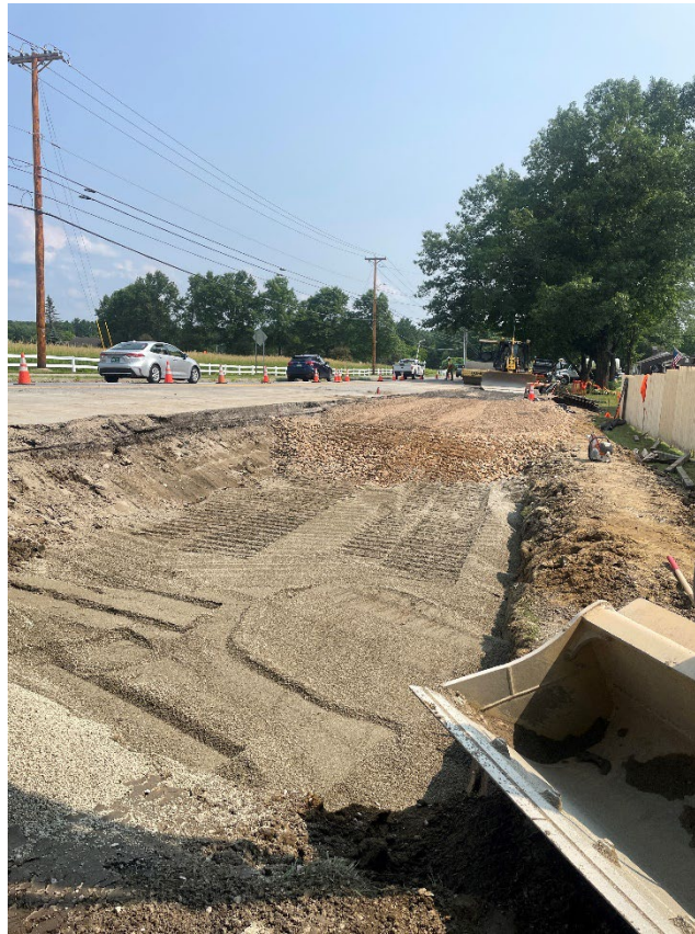
Crews widen the roadway along VT 2A southbound between Meadowrun Road and Industrial Avenue in Williston, VT.