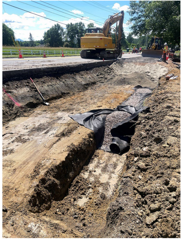
Crews widen the roadway and install drainage along VT 2A southbound between Meadowrun Road and Industrial Avenue in Williston, VT.