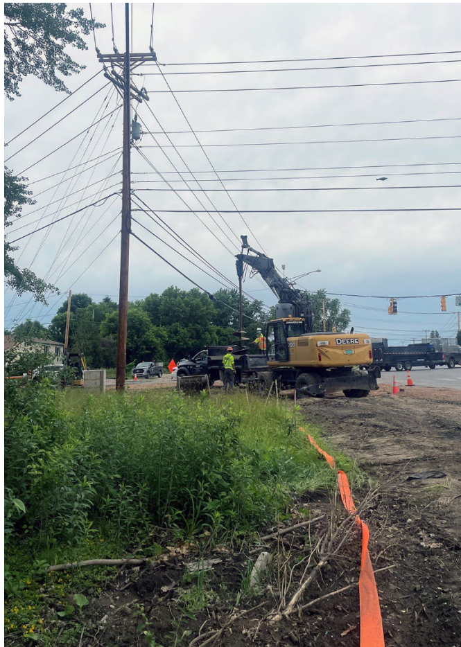
Crews conduct work for the new traffic signals at the intersection of VT 2A and Industrial Avenue in Williston, VT.