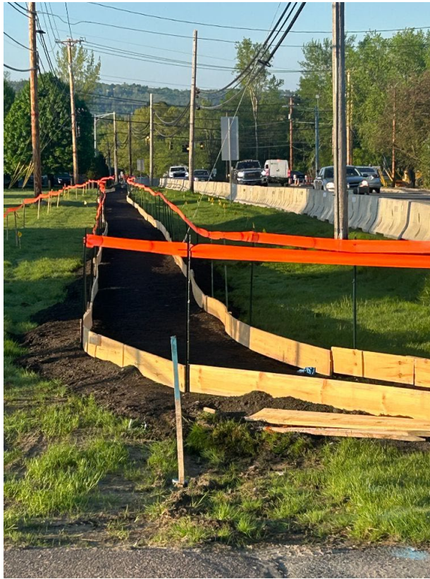
Crews install temporary pedestrian access routes along VT 2A in Williston, Vt.