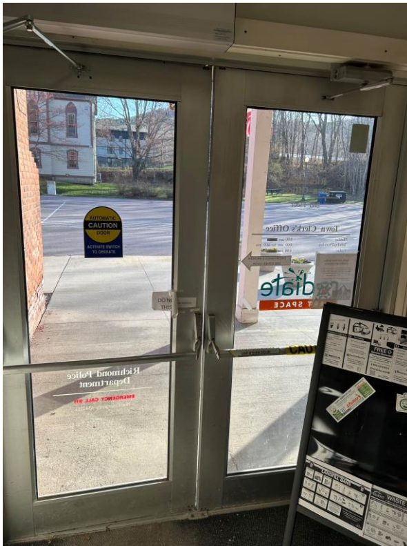
Outside double doors

The current doors are illustrated below: