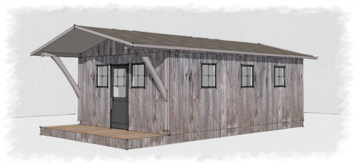
3 EXTERIOR PERSPECTIVE NOT TO SCALE