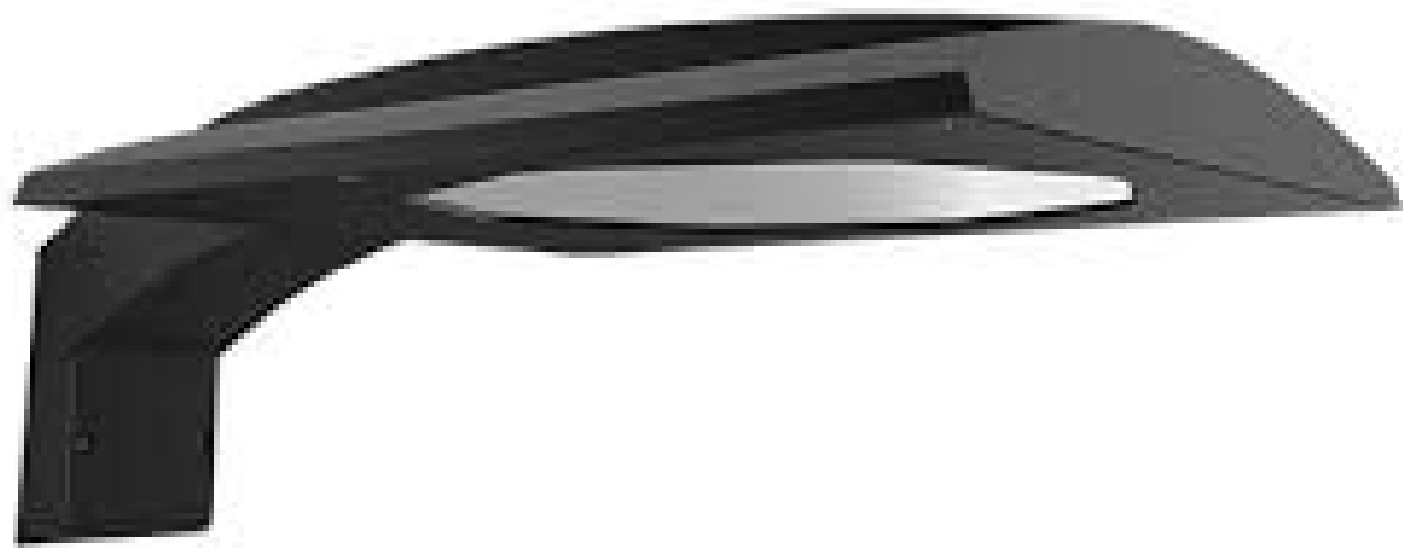
RAB "VELOT" LED POLE MOUNTED LIGHT FIXTURE MOUNTED ON 20 FT PLOES.