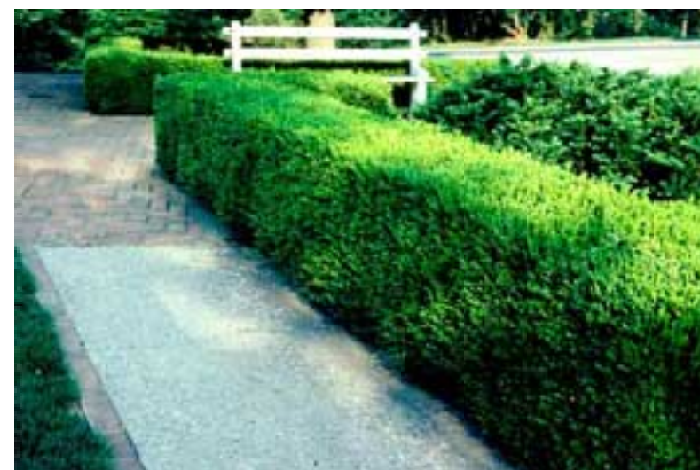
WINTERGREEN BOXWOOD ( BUXUS MICROPHILIA )