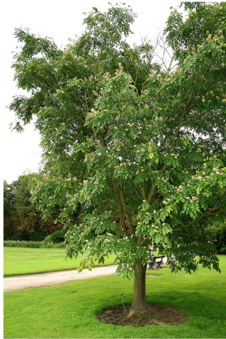
AMUR MAACKIA -