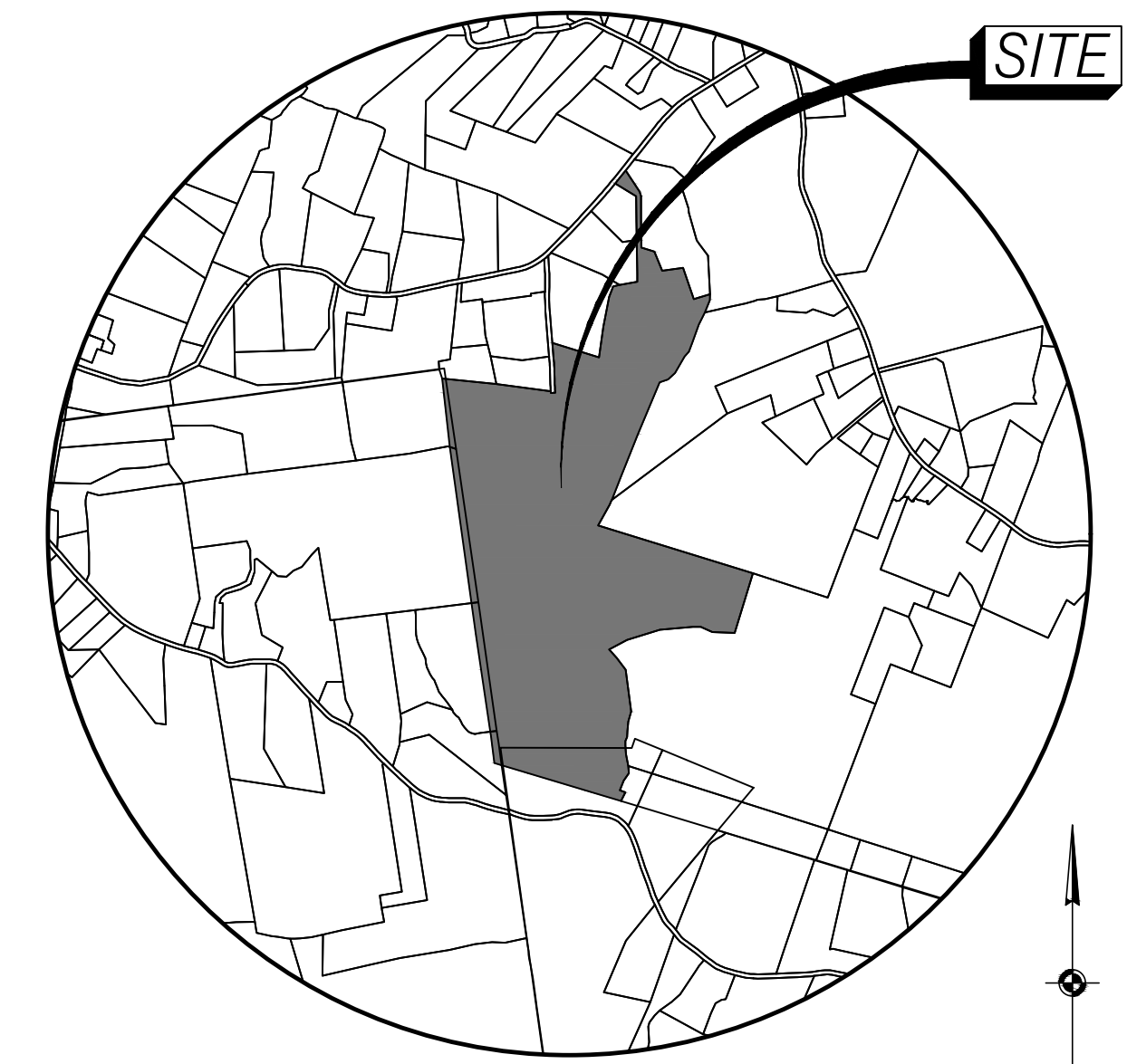
LOCATION MAP SCALE: 1" = 2,000'