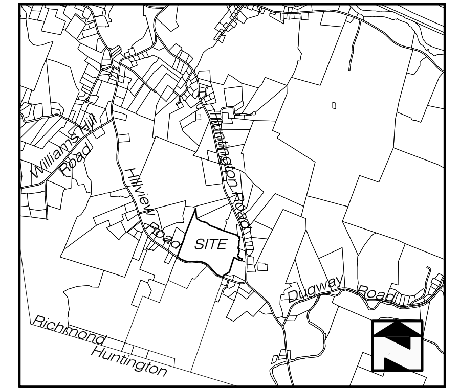
Location Plan n.t.s.