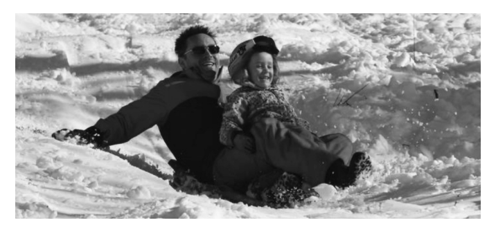
Wintertime fun at RLT's Willis Hill Preserve.

Downstream at the Lower Gorge and Triple Buckets, a River Steward was on hand many days to help visitors learn about the area's natural history and safely enjoy its beauty. The River Steward Program was a joint project between RLT and the Vermont River Conservancy. We also created an online visitor survey to help us better understand how people are use the Preserve and how we can improve it.