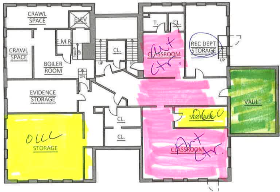
Lower Level Floor Plan