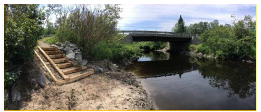
Figure 5. Example of stairs with boat ramp shortly after being installed

Next Steps for Selectboard : Authorize the Town Manager to enter into an agreement with the Fish & Wildlife Department for the cost of materials and with VYCC for installation. The Selectboard could authorize the drafting of a CRF application for up to $2,000 for incidentals. Richmond would have to agree to keep the stairs in place for at least 10-years and perform basic maintenance (e.g., brush off sand after major high-water events).