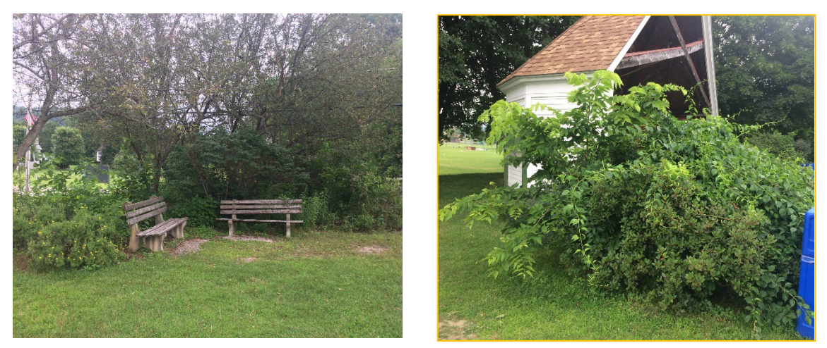
Figures 2-3 overgrown landscaping at the bandshell

Background : The rip rap project originally included a plan to re-plant trees at the top of the bank after the rip rap was installed. Due to budget overruns and personnel changes, re-planting never occurred. As our committee looked to resolve this need it became clear that the other plantings in the bandshell area are in dire need of attention (e.g., over-grown, full of weeds). The design could include new plants, restoring benches and signage. We have found a landscape architect who will help design the plan. Because this goes beyond our original charge, we feel we need authorization from the Selectboard first.