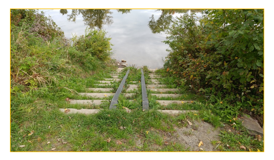
Figure 6. Another stair design example with boat ramp several years after installation.