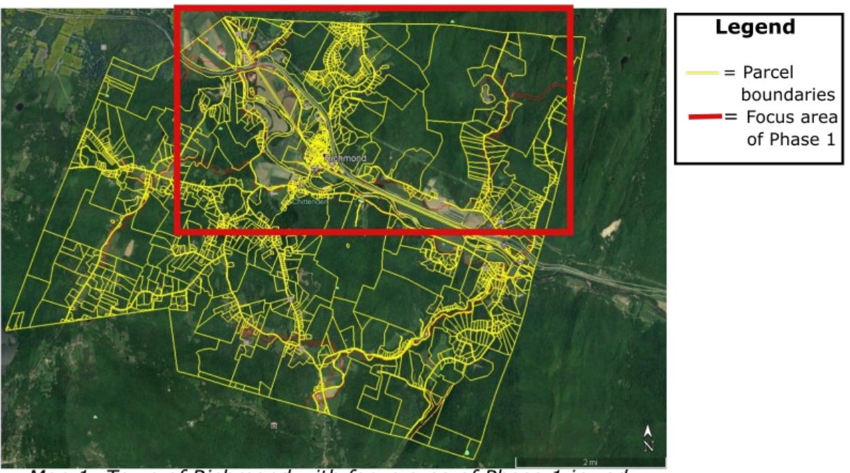
Map 1: Town of Richmond with focus area of Phase 1 in red