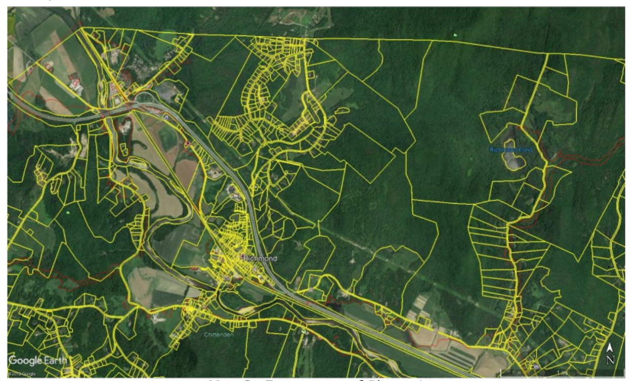
Map 2: Focus area of Phase 1