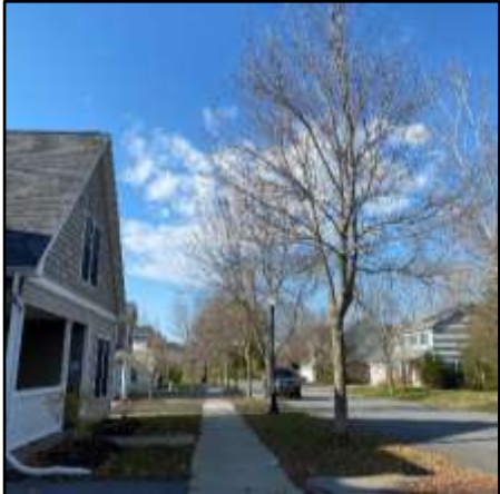
A dozen small ash planted at the same time that Church St neighborhood was developed will be replaced.