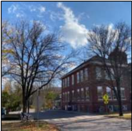
Healthy ash outside Town Center will be treated