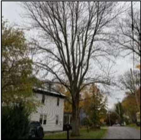
Large, healthy tree on Baker St to be treated.