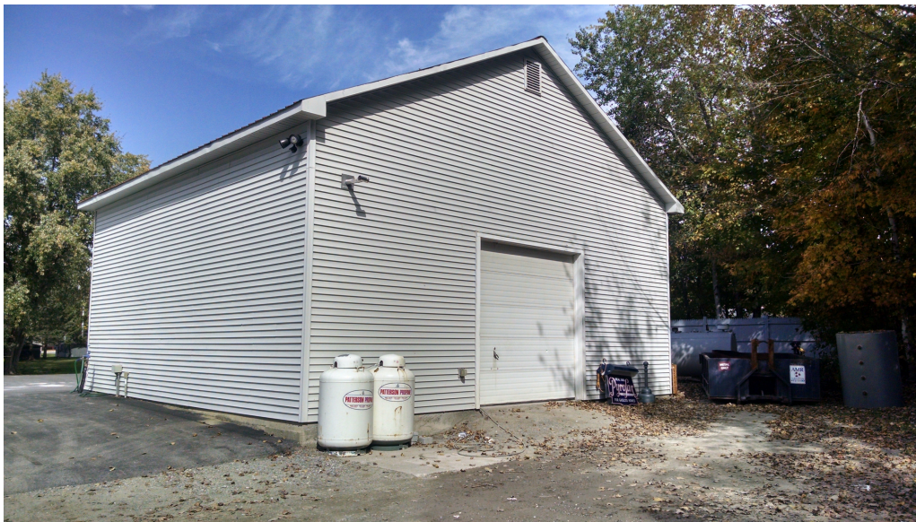
Rear View (photo taken 9/29/14)