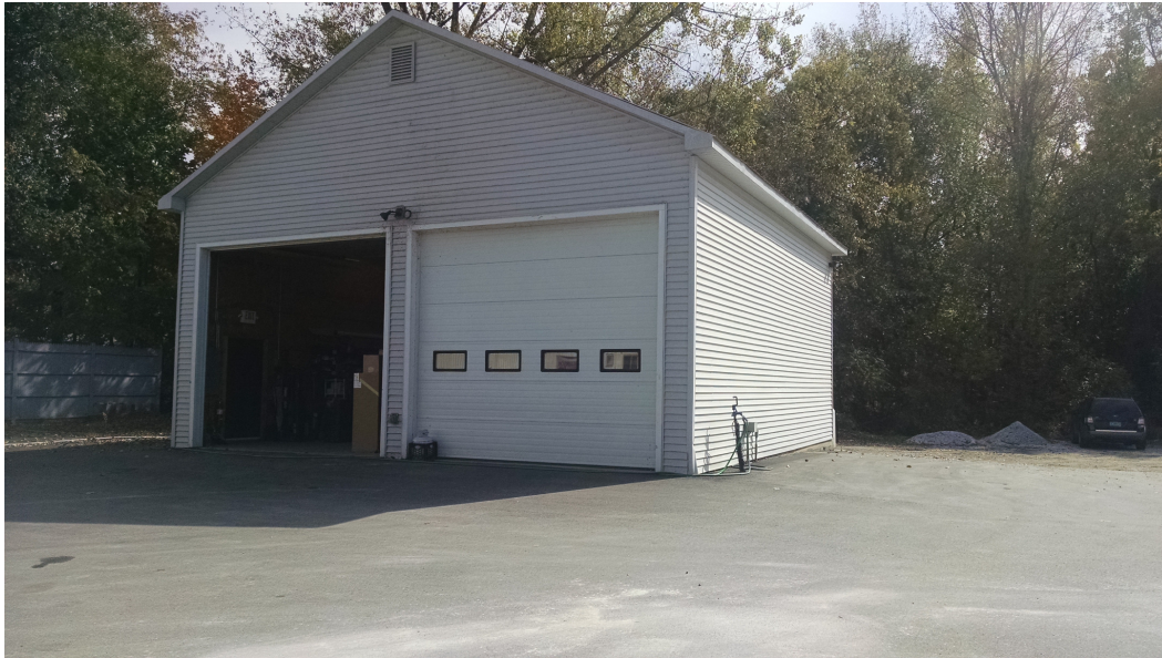
Front View (photo taken 9/29/14)

If using the Elevation Certificate to obtain NFIP flood insurance, affix at least 2 building photographs below according to the instructions for Item A6. Identify all photographs with date taken; "Front View" and "Rear View"; and, if required, "Right Side View" and "Left Side View." When applicable, photographs must show the foundation with representative examples of the flood openings or vents, as indicated in Section A8. If submitting more photographs than will fit on this page, use the Continuation Page.