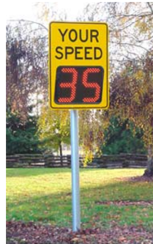
The SPEEDCHECK-1520F pole-mounted radar speed sign.