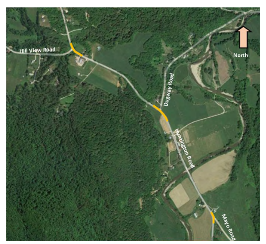
Figure 5: Horizontal Curves along Huntington Road

A curve safety assessment was conducted on December 14, 2021, to determine advisory speed to travel horizontal curves at three locations along Huntington Road; Hillview Road, Dugway Road and Mayo Road, using a slope meter (ball-bank indicator). The following figure shows the study horizontal curves on Huntington Road.