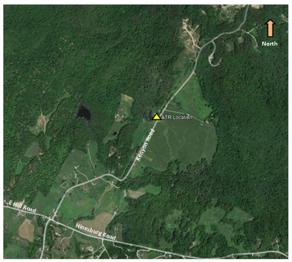
Figure 6: Kenyon Road and ATR Location