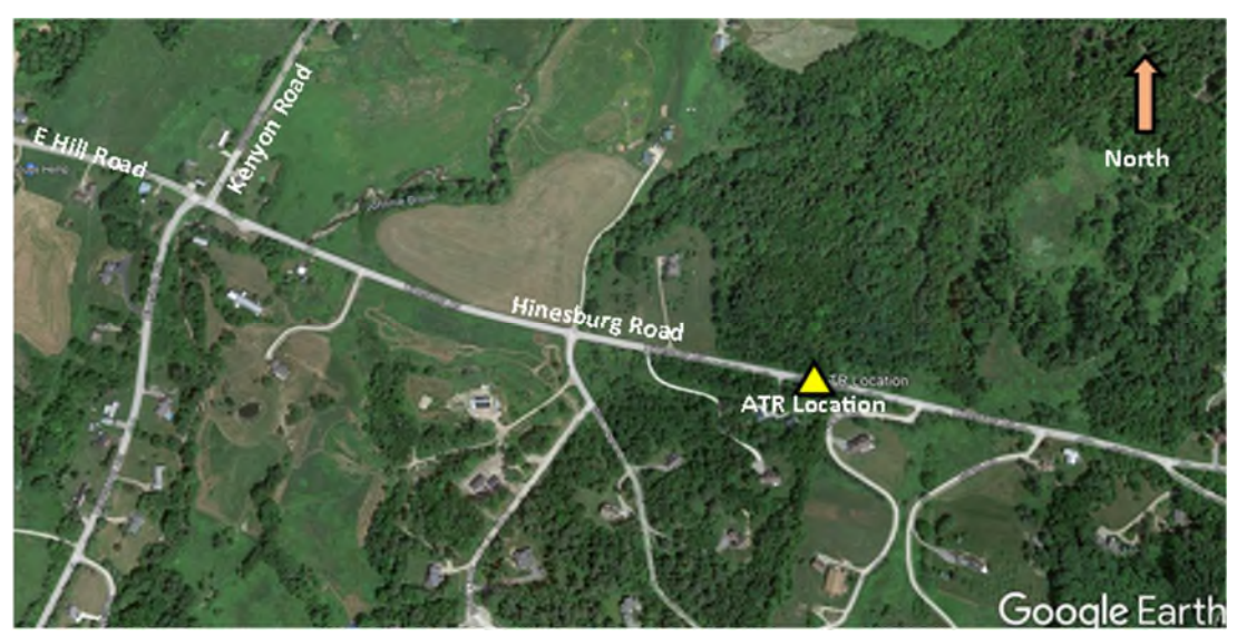
Figure 1: Hinesburg Road and ATR Location

Hinesburg Road is a paved road classified by the state as a Class II Town Highway and functionally classified as a Major Collector. The study area for this road extends from the intersection of Huntington Road to the Hinesburg Townline. The CCRPC staff installed an Automatic Traffic Recorder (ATR) along Hinesburg Road at the location shown in Figure 1 to collect traffic volume and speed data. Data were collected between June 09, 2021 and June 17, 2021. Figure 1 shows the study area and ATR location.