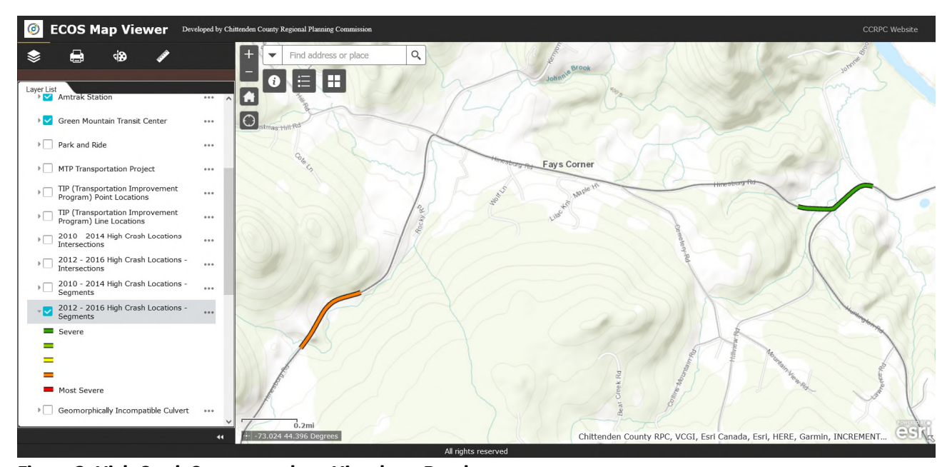
Figure 2: High Crash Segments along Hinesburg Road

There were 46 crashes, including a fatal crash, reported in the last five years along Hinesburg Road. A crash report summary is attached in the Appendix. Most of the crashes were reported as single vehicle crashes with property damage only. Most common contributing circumstances for crashes were reported as distracted driving, driving too fast for conditions and failed to yield right of way. There are two high crash segments along Hinesburg Road: 1) at the intersection of Huntington Road and 2) south of Mansfield Way on a curve segment shown in the figure below.