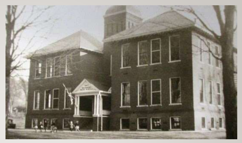
Baker High, 1940