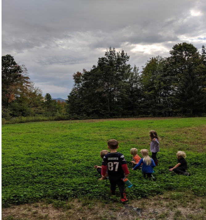
Children from Honeycomb Kids taking a break at the log landing and enjoying the Camel's Hump view.