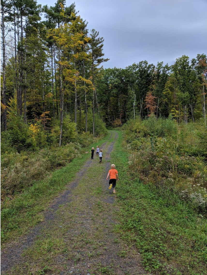
Children running up the VELCO road