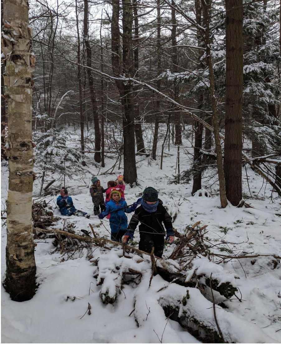
Children explore the forest in the winter