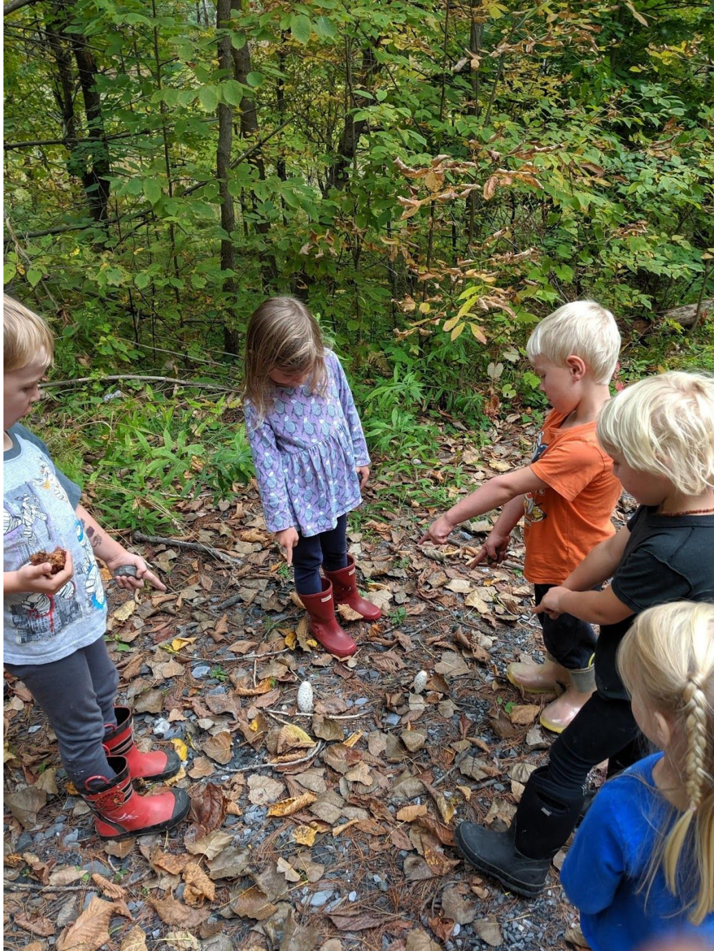
Children discover mushrooms growing on the logging road